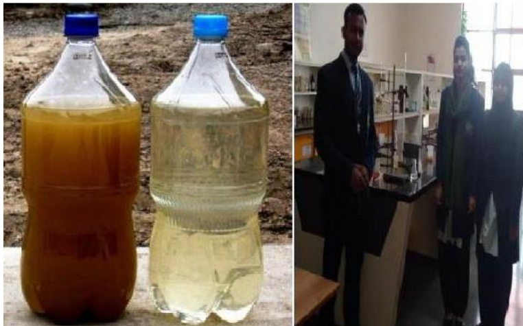
Figure 5: Before and after treatment of a sample, and a sample point near the Nasaradi River in Nashik

At low flow rates, to take the sample deeply, a hand-pump extending with the tube should be used. Then, a depth sample tumbler (250 mL, 500 mL, or 1000 mL) with screw-in extension rods should be used.