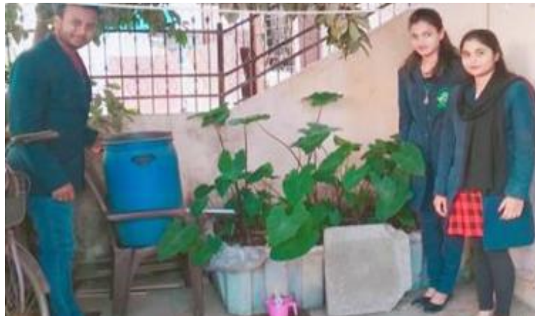
Figure 3: A Colocasia plant is being planted

A graded filter is installed in the blower portion of the reactor to prevent soil from entering the under drain pipe and washing away the soil. A layer of fertile soil 20 cm thick is given over the filter. A 1-2 cm thick layer of organic manure is applied over the soil layer. After these layers have been laid and the plants are watered, planting can begin. The filter is made of crushed stone with a gradient of 40 mm near the drain pipe and 5 mm just below the soil layer on top. Various plant species were evaluated for plantation in RZT system. The elephant ear, or arum, was selected as a plant species in the RZTS based on local availability, its ability to ingest organic and inorganic materials from waste, and the revenue generated by selling the plant.