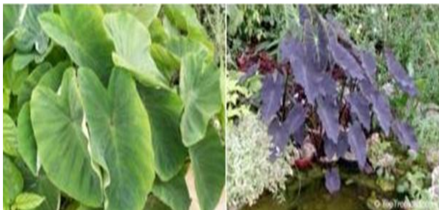
Figure 4: Colocasia plant

Colocasia esculenta: It is considered one of the earliest plants to be grown. Which are root vegetables is a tropical plant grown extensively for its edible corms, often referred to as taro. Linnaeus originally named two genera of cultivated plants, now known as Colocasia anticorum and Colocasia esculenta , but several highly variable genera, with modern botanists considering them all to be members of a single, Colocasia esculenta .